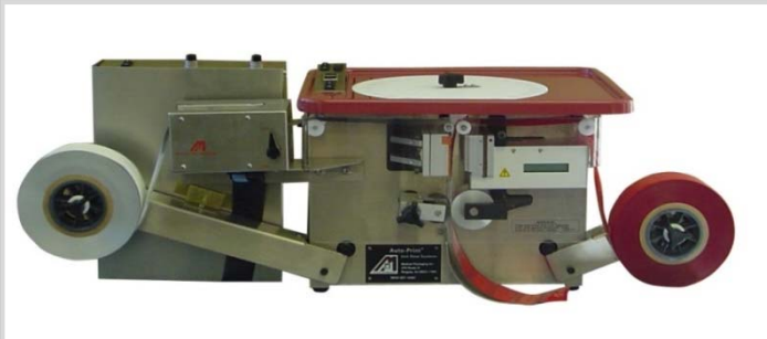
Barcode Verifier Attachment (Optional)